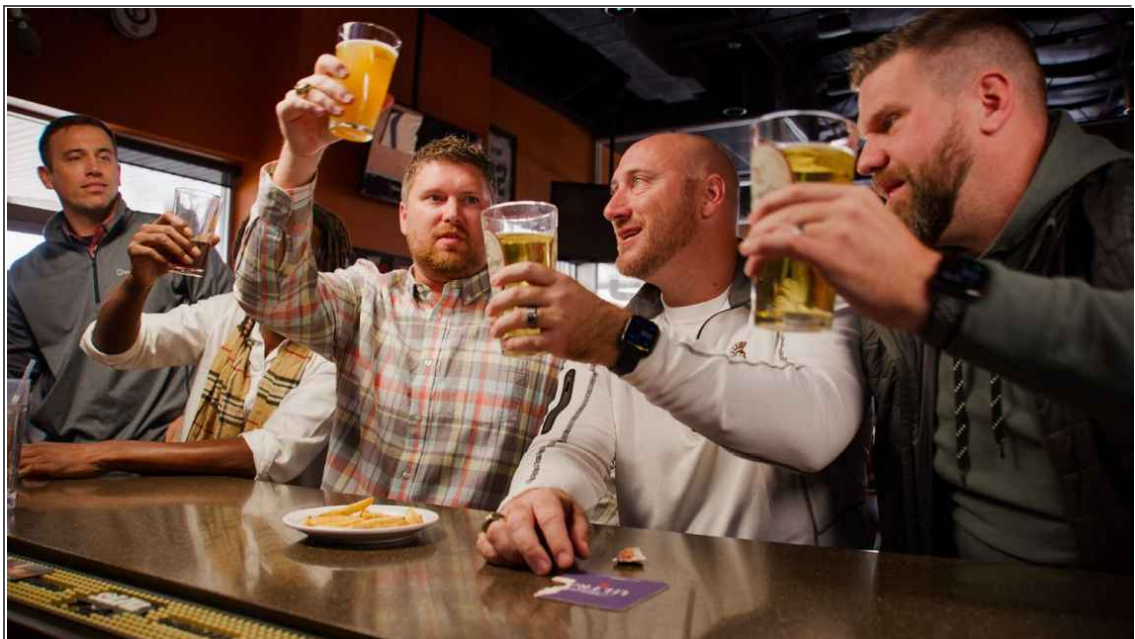
For the 20th anniversary of the 2002 Ohio Division II championship, former Roger Bacon teammates gathered