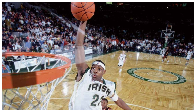
After being anointed "The Chosen One" by Sports Illustrated in February 2002, junior LeBron James and his St. Vincent-St. Mary squad met Roger Bacon in the Division II state championship. It would be LeBron's only loss to an Ohio team in 82 games.